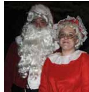
Lighting of the Lakewood Christmas Tree