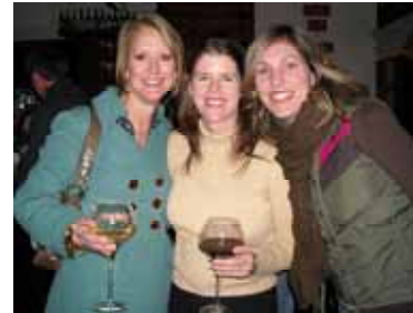
Holiday Party at the Lakewood Tavern